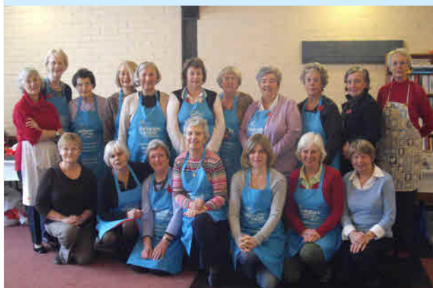
The Committee and helpers ready for work.