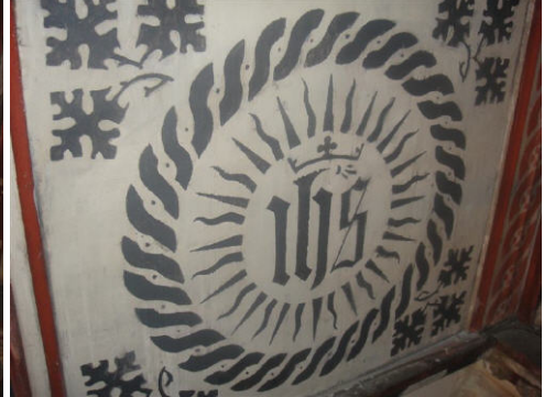
Another ceiling panel before......and.....after restoration