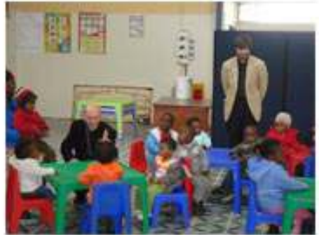
At the Fikelela Children's project, St Francis Church, Khayelitsha

The St Francis Mandela Park Project supports the many children who have been orphaned by AIDS. They want to start a soup kitchen for their day centre and to get another large portacabin to allow for skills training.