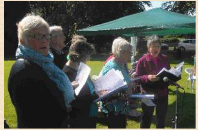
Some strong voices to help the singing