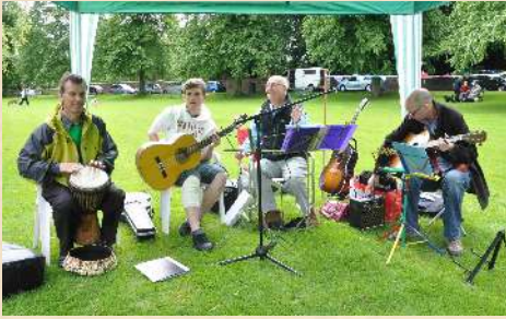
The Band gathered to lead our worship