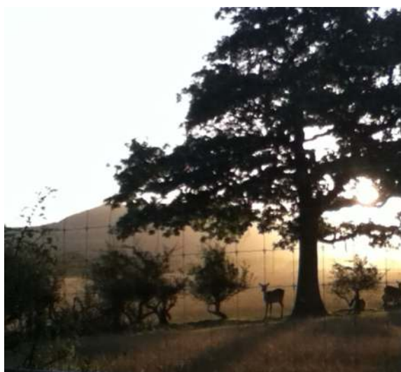
September morning along Easby Lane

The beautiful light mornings are leaving us until next year and the dark nights are returning. Don't forget to keep an eye out for your neighbours over the winter months.