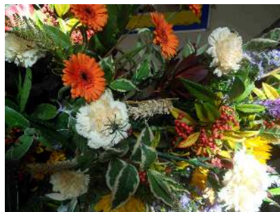
Spot the spider and other critters in the Harvest flowers!

Keep on passing the blessings on, and you will find even more return to you.