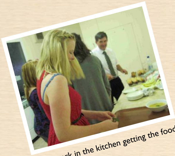
Hard work in the kitchen getting the food ready