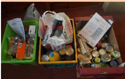
Pictured left: Some of the Produce collected at the morning service.

If you don't come to Church, but still want to make a donation, either give to someone you know who comes, or drop things off on the Saturday beforehand.