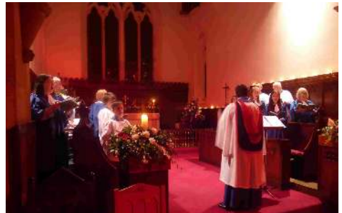
The Choir sang a new Carol, "Never a Baby Like Jesus. See our Christmas Videos here

A Special Appeal took place at all our Carol Services to raise funds for the Stockton Based Charity, A Way Out , which helps the young and vulnerable in our own area.