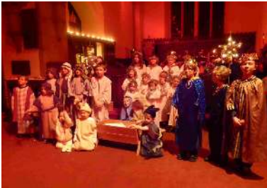
Over 400 people attended the Crib Service