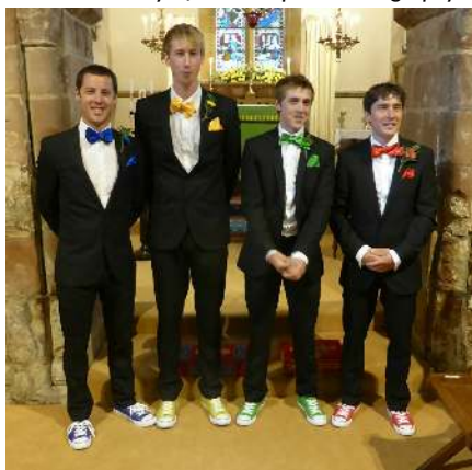
Why should the girls get all the colour? Just love the shoes!