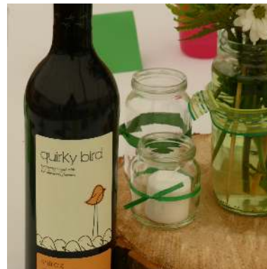
Message in a bottle!