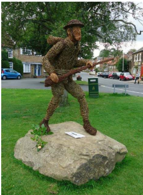
The Willow Soldier on High Green, serving as a reminder of the 100 th Anniversary of the First World War