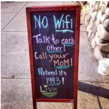
Sign seen outside a Cafe

Then she said, (as only a Grandma would know), "Did it ever occur to you the only place she can reach to get water is the toilet?"