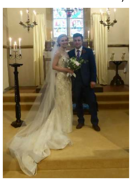
Above right. Some super dresses, and long trains appear to be in this year - so far!