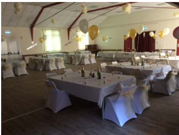
Christ Church Hall becomes a Reception Venue!

The last Hall committee meeting decided that the best way forward was to have a professional 'Feasibility Study' undertaken by a local architect so that all the work required to bring the Hall and Coffee Lounge up to 21st century standards can be properly scoped and costed. The committee also agreed that this would be paid for by submitting an application