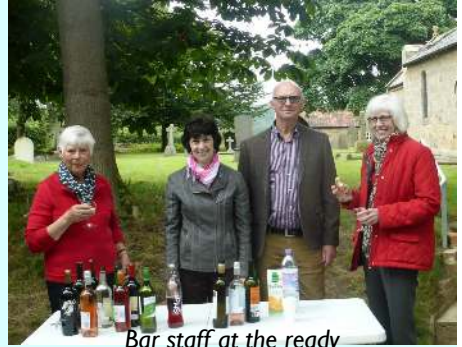
Bar staff at the ready

Despite a wet start with light rain from 9am until 11am, we set out the Memorial Garden for our picnic trusting in our weather Apps! When we opened the Church door at the end of the St Oswald's Day Service the sun was shining. Over 55 folk of all ages had gathered to pay tribute to our Patron Saint - Oswald, King of Northumbria.