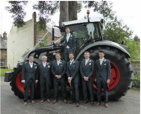
The Groom arrived in style!