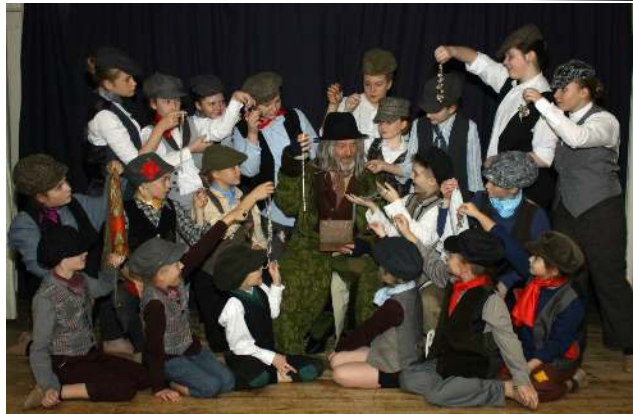
Bradley School of Dance & Guests