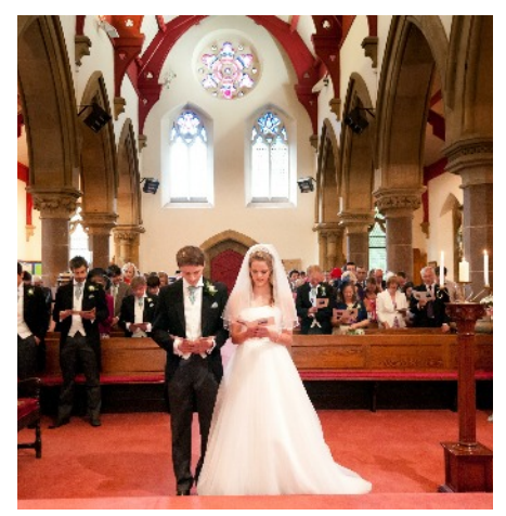
Debbie Stogden Photography