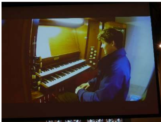
Stokesley Student having a go