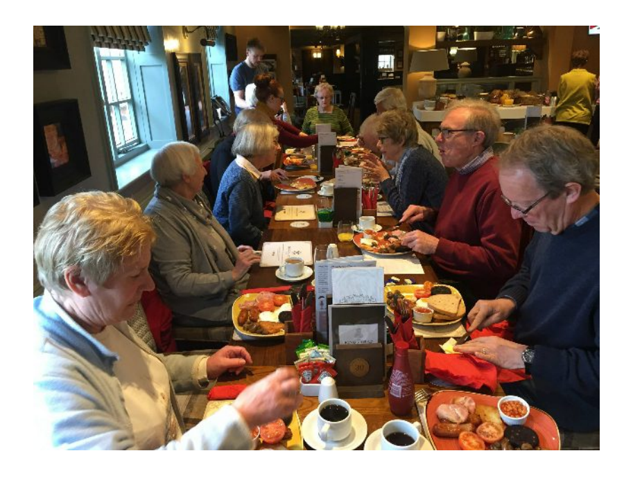
Get Up With God Ascension Day Special 7am on Thursday 25th May at Saint Oswald's Church

What better way to start the day, than with worship followed by breakfast together? We had a change from our weekly Friday 7am slots at Christ Church, and gathered instead in Saint Oswald's, Newton under Roseberry, for the last Friday in Lent. The silence and atmosphere of this ancient Church made a wonderful setting for worship. Afterwards we moved to the King's Head in Newton for breakfast together. Our congregation was almost equally drawn from Newton, Nunthorpe and Great Ayton - with a stray from Ingleby Greenhow!