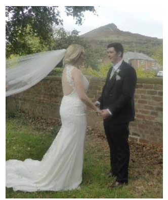
Our own bespoke view of Roseberry Topping