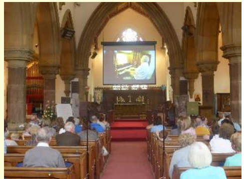
Stops & Strawberries

course very grateful to other members of the congregation who offer to help us without whom it would be a much harder task.