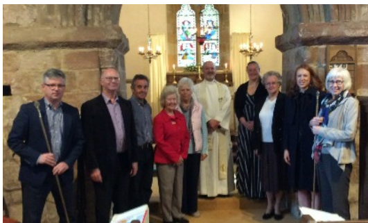
The PCC at the Reception of Churchwardens