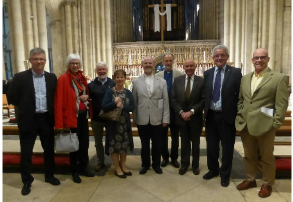
Churchwardens & clergy at York Minster for the Admission of Churchwardens Service

Hopefully this didn't have a huge effect on Saint Oswald's as I worked the Rota so I was still covering most of the services, but the extra Sunday demands - especially spending most Sundays doing Christenings at one of the three Churches, meant that I was unable to get to any Wedding Fairs at all last year. The proof of the pudding is in the eating, and it's not a surprise that we have seen our weddings at both Saint Oswald's and Christ Church take a drop. (St Mary's Nunthorpe, on the other hand, has seen quite an increase!)