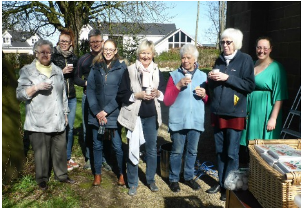
The Spring Clean volunteers. Unlike an oven, the Church doesn't clean itself!