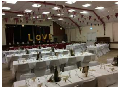
We believe Hall users should have good facilities for activities & occasions