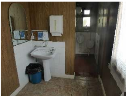
Using the main hall toilets in winter was like walking back in time - in Siberia!