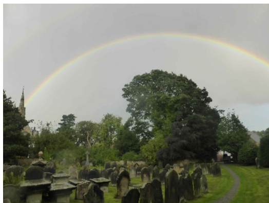
A rainbow touching Christ Church - a sign of God's promise?

Our Parishes are a beacon in the Diocese, and I often hear good things said about Great Ayton and Newton under Roseberry, so lets keep the beacon shining brightly.