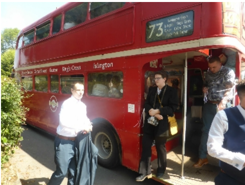
Arriving in style on a Routemaster bus