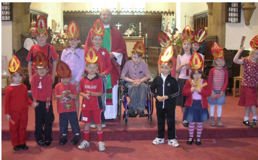
Pentecost 2004 with the Sunday School