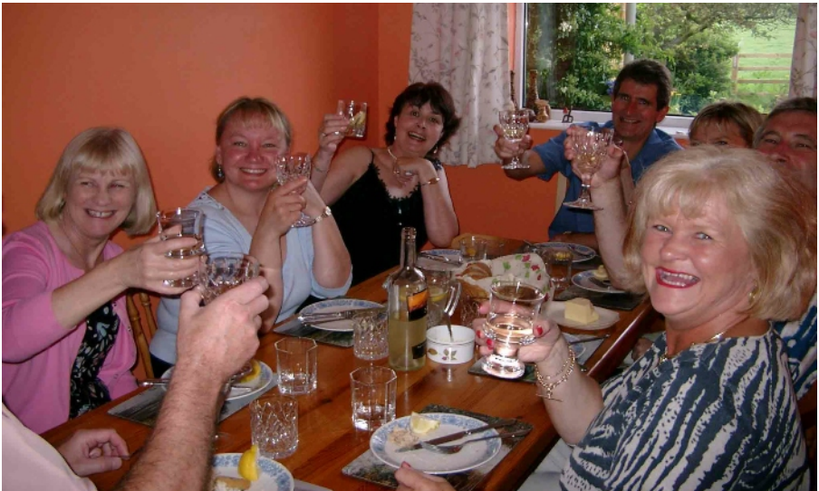
A picture of those who attended the first Safari Supper for SARA