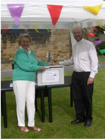
The first envelope of the morning

Gift Day for the Spire Appeal - June 2004