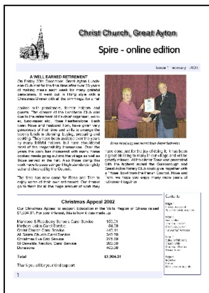
The first ever copy of Spire