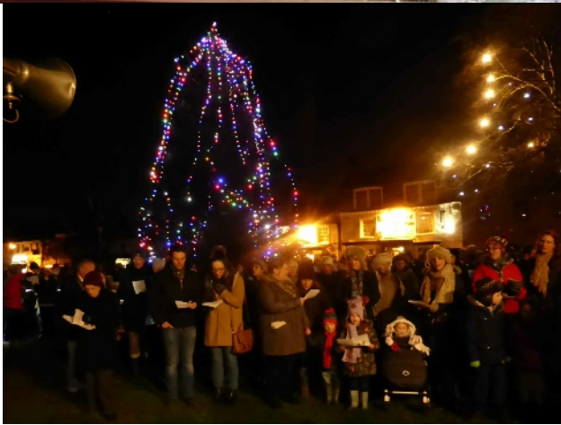
Carols on High Green going ahead, but sadly All Saints cancelled this year, so here's a memory of good times that will hopefully return soon.