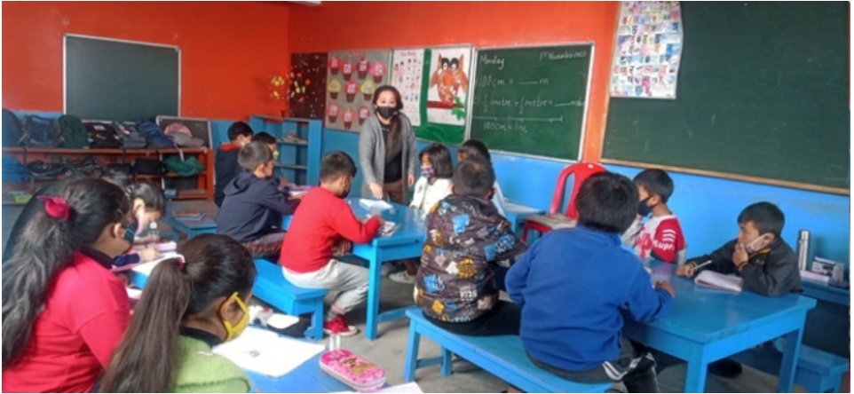
Special tuition November 1st Roseberry School Darjeeling