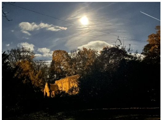
Full Moon over All Saints Church