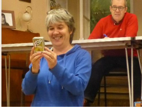
Auctioning the game "Plop"

Christ Church Hall, Guisborough Road, Great Ayton.