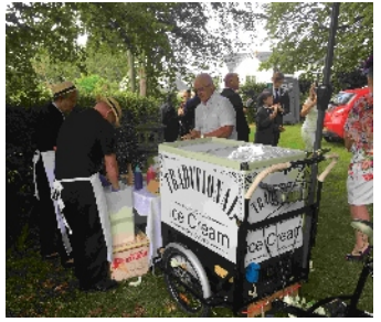
Ice creams for guests in Newton's Memorial Garden after a recent wedding. A lovely idea.