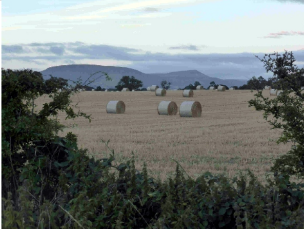
Bringing in the Harvest down Easby Lane